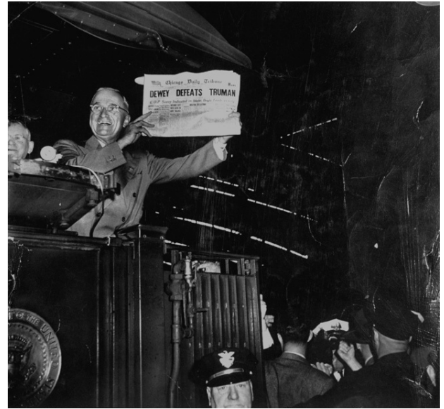
Dewey Defeats Truman