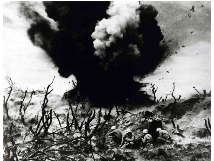
Iwo Jima: "Sticks and Stones, Bits of Human Bones"