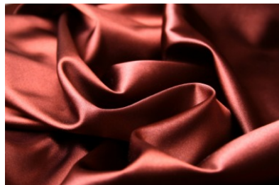
ver à soie