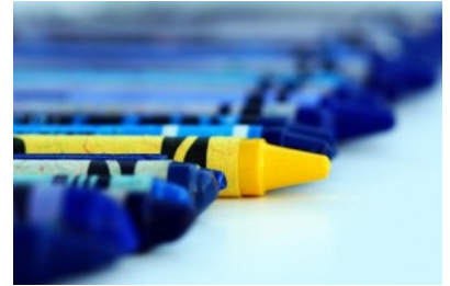
You are my Sunshine