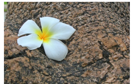
Soft vs. Rough Texture