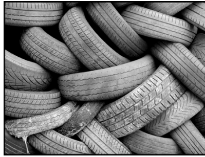
My car is making a "Whirring" sound...